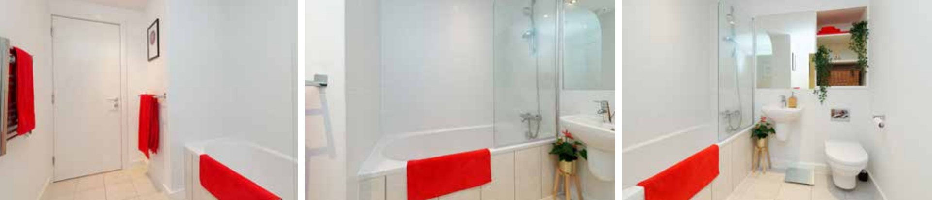
BEDROOM, BATHROOM & HALL