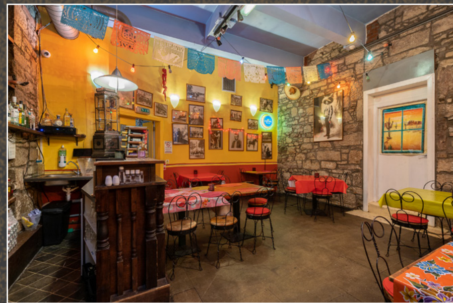
LOWER RESTAURANT 1