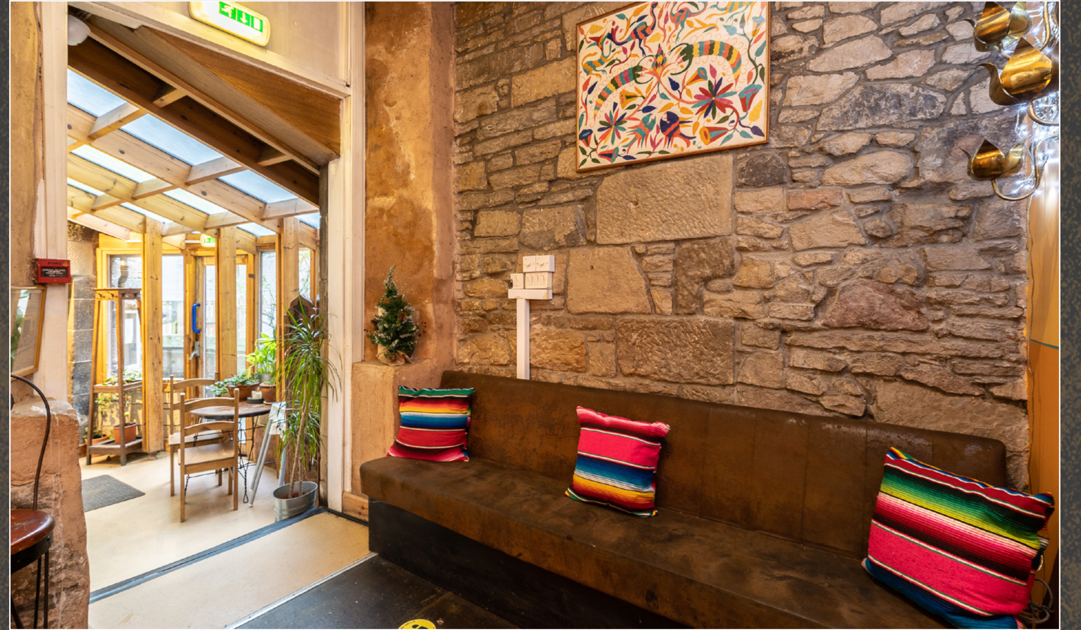
EXTRA SEATING AREA