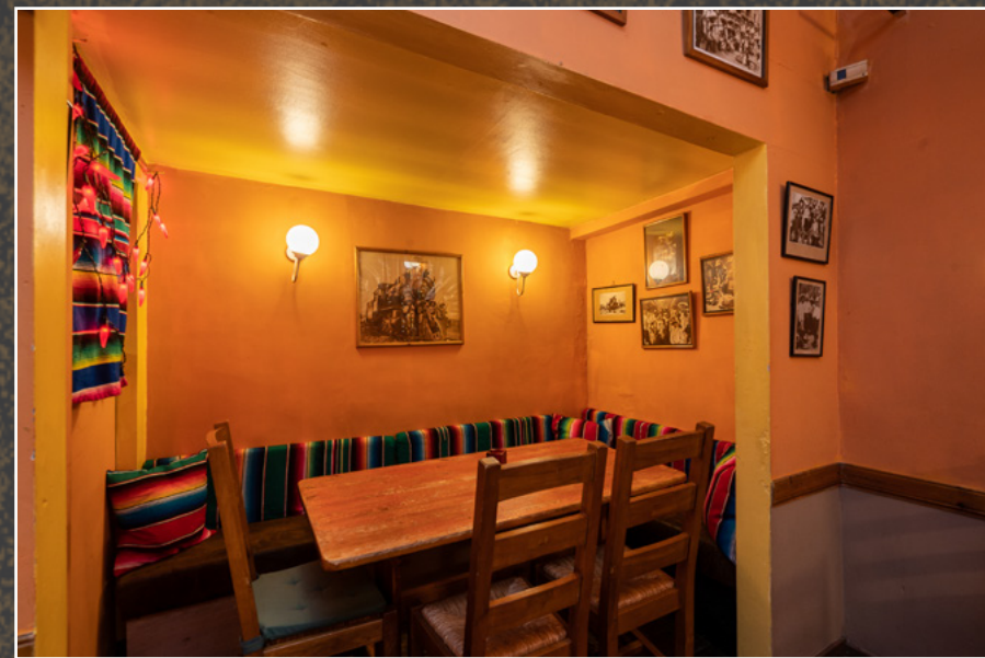
LOWER RESTAURANT 2