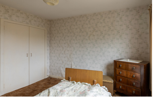
BEDROOMS & BATHROOM