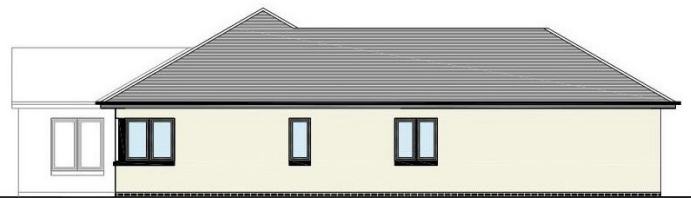
LEFT ELEVATION AS PROPOSED