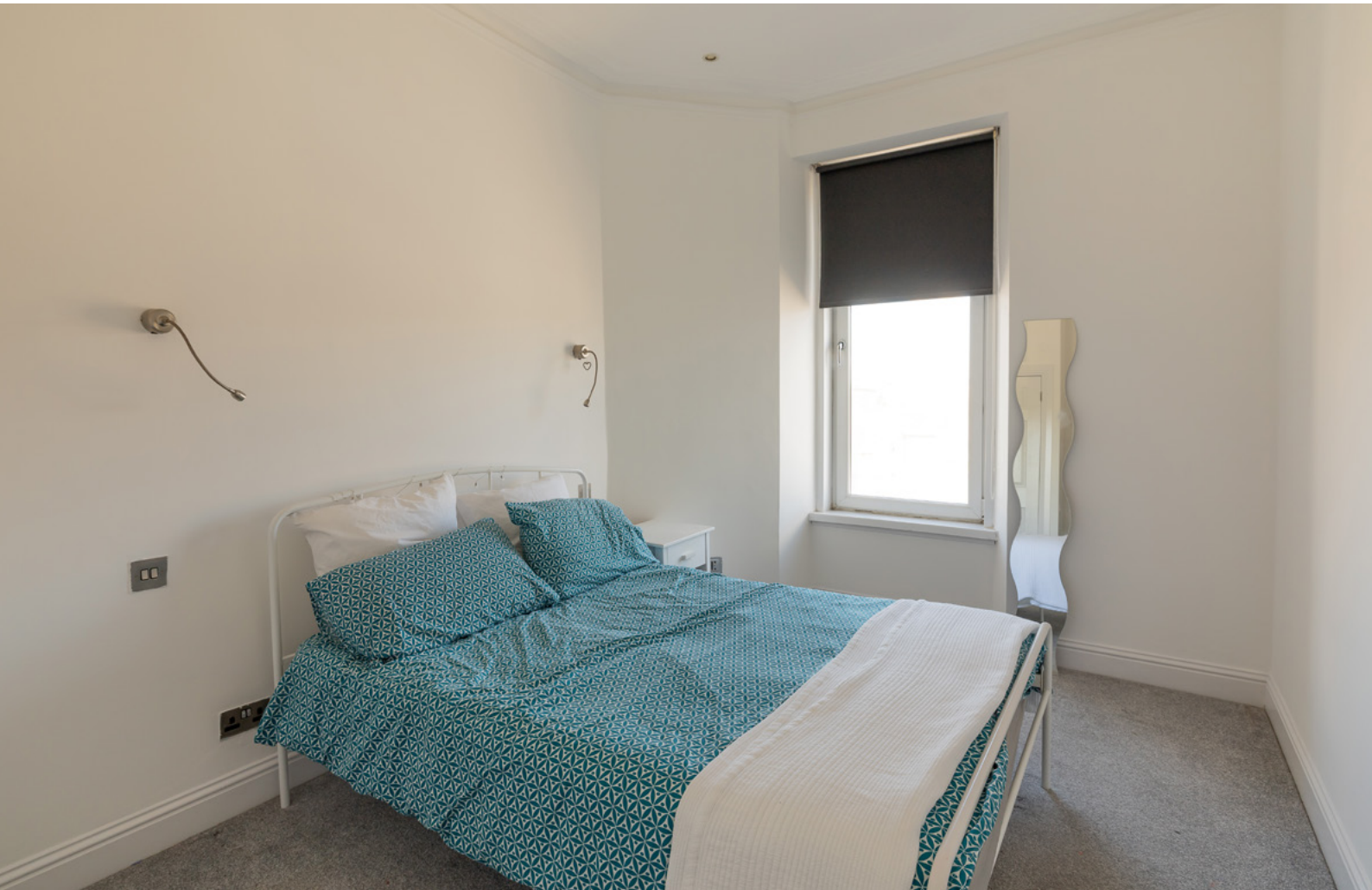
Bedroom 2 & Bathroom