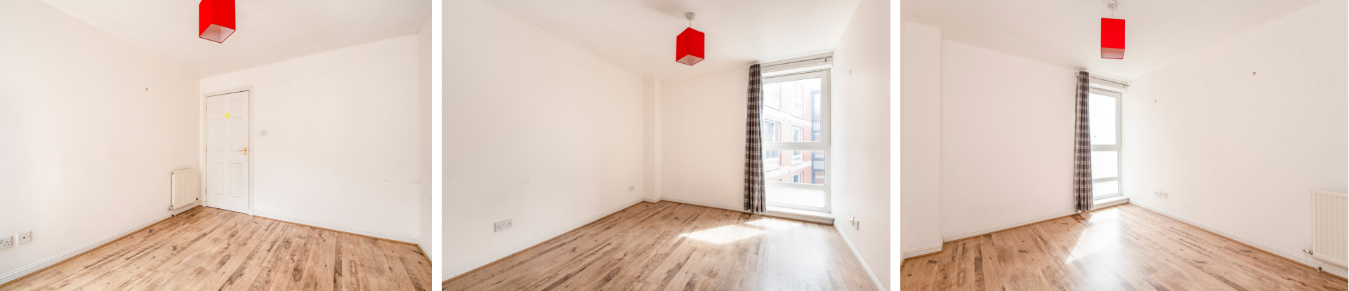
bedrooms & bathroom