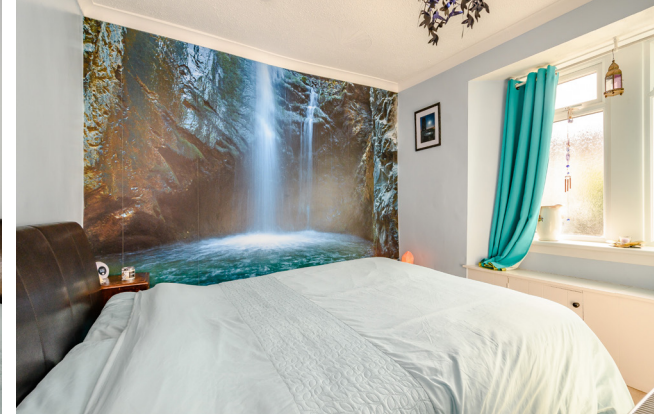
BEDROOM & BATHROOM