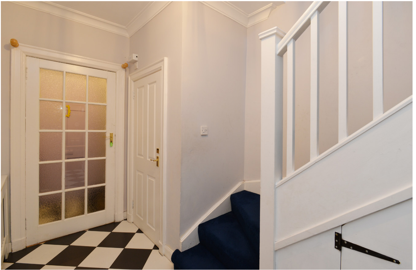
The entrance hallway, beautifully tiled, leads to a thoughtfully placed downstairs WC, adding convenience and practicality to the ground floor.