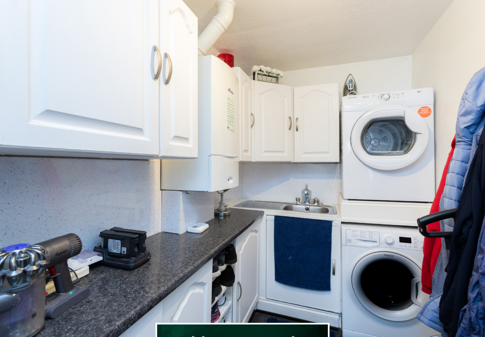
Utility & En-suite