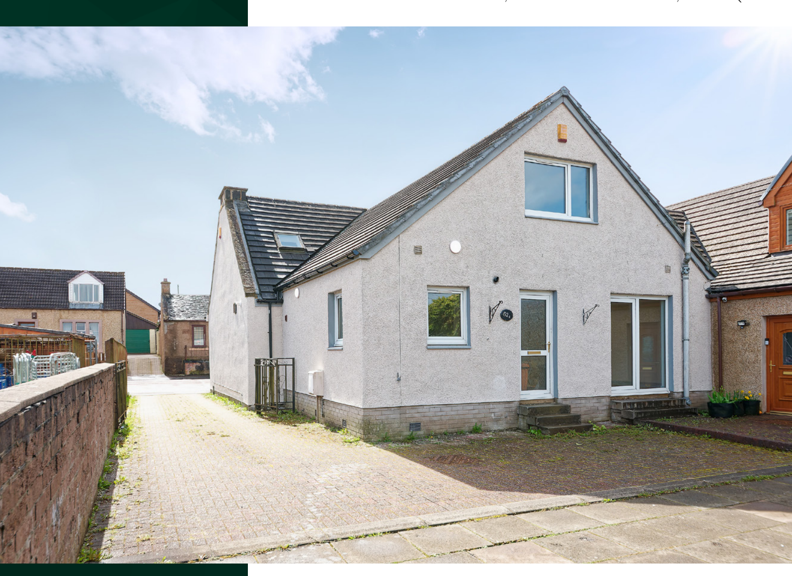
EXCELLENT THREE-BED SEMI FULLY REFURBISHED