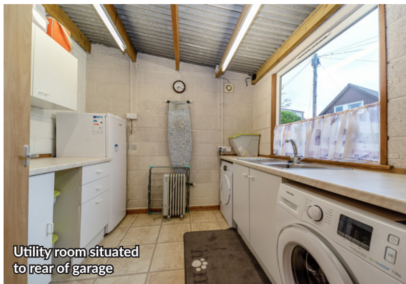
Utility room situated to rear of garage