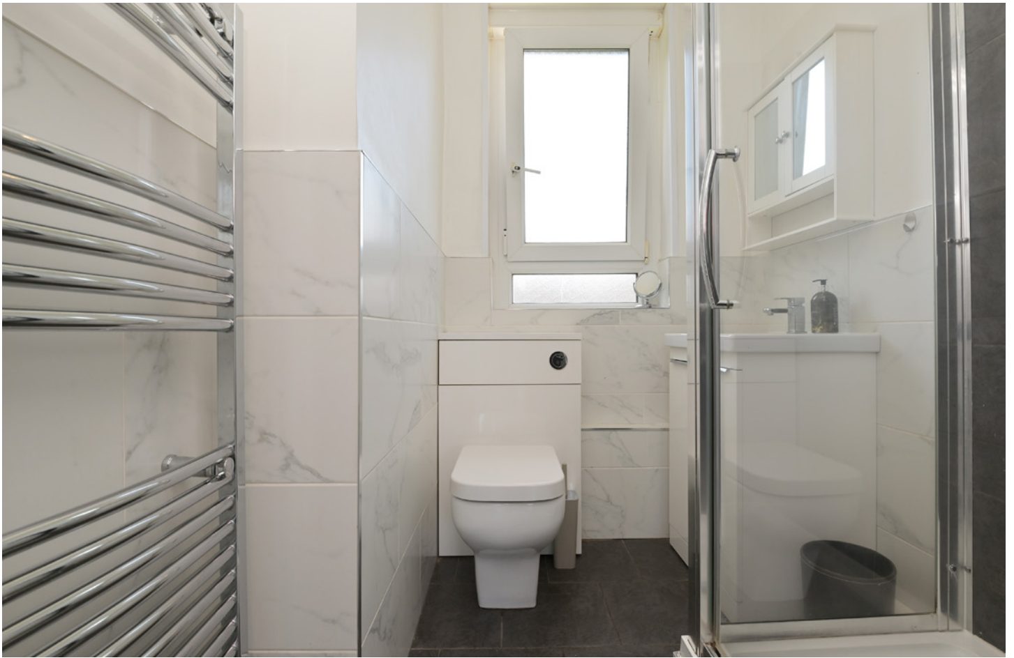
The bathroom is fitted with a white three-piece suite and is in good condition.