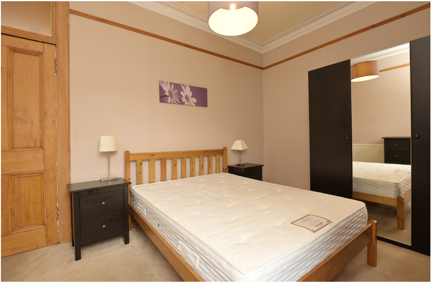
The bedroom which overlooks the rear garden and has ample space for free-standing storage.