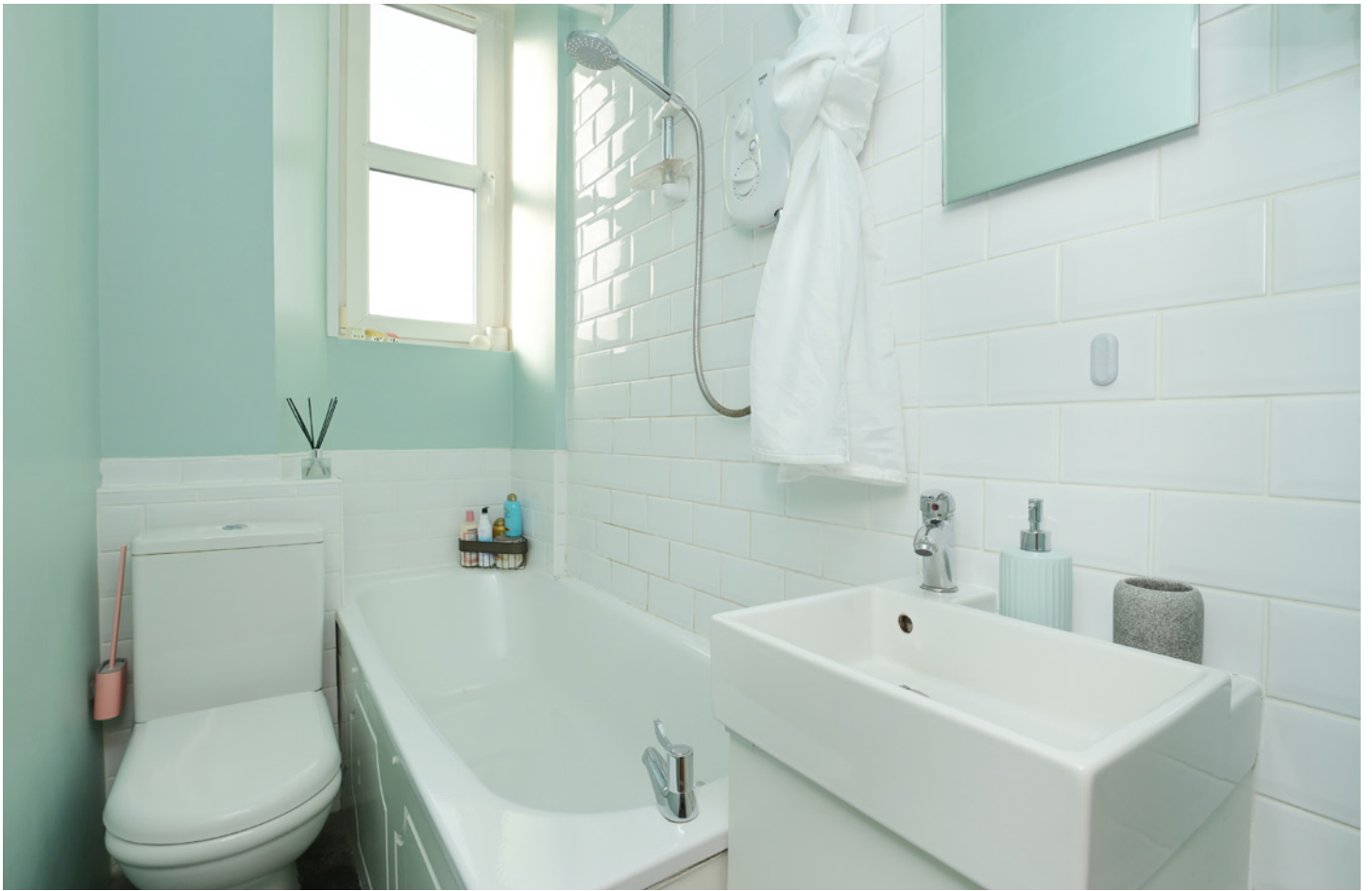
The bathroom is fitted with a white three-piece bathroom suite and a shower over the bath. The bathroom is neutral and partially tiled.