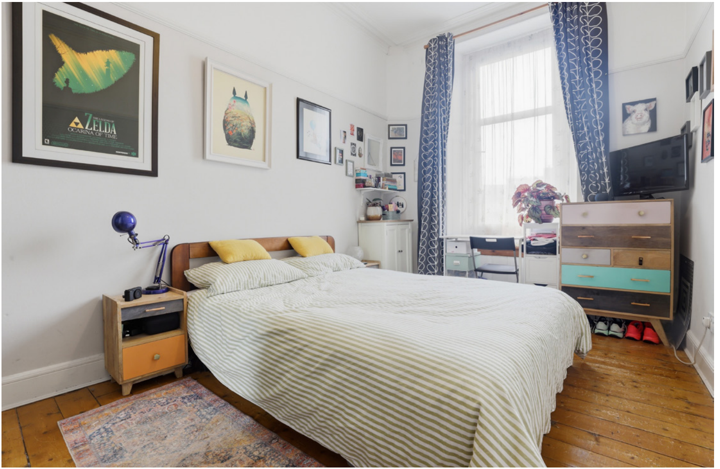
The bedroom is a modern and bright room, and the accommodation is completed by a well-appointed three-piece family bathroom.