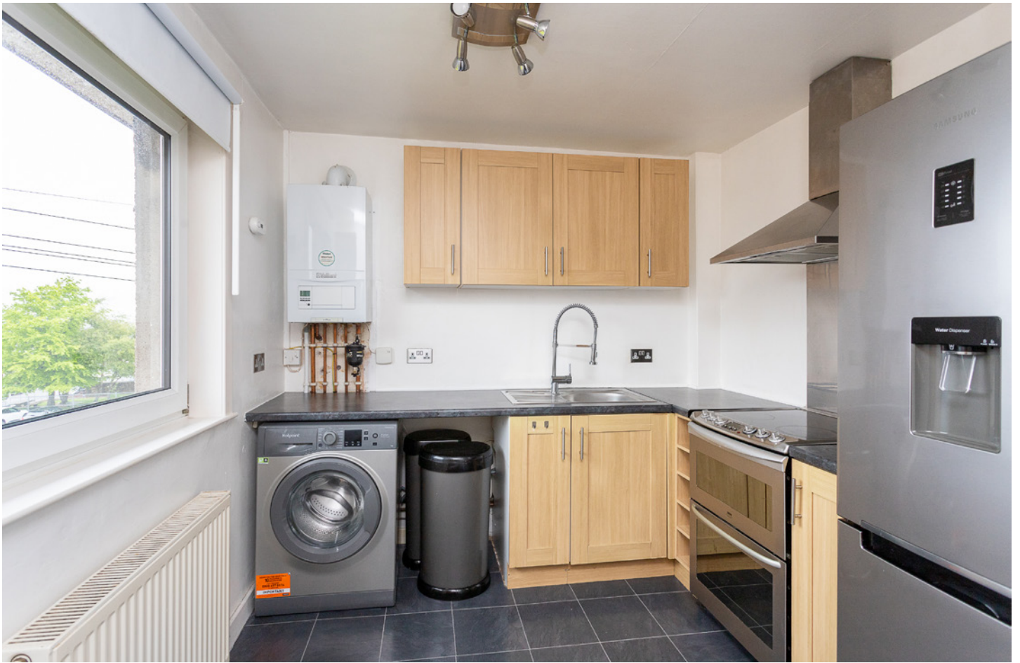
The kitchen/dining room features a range of floor and wall-mounted units with windows overlooking the rear garden.