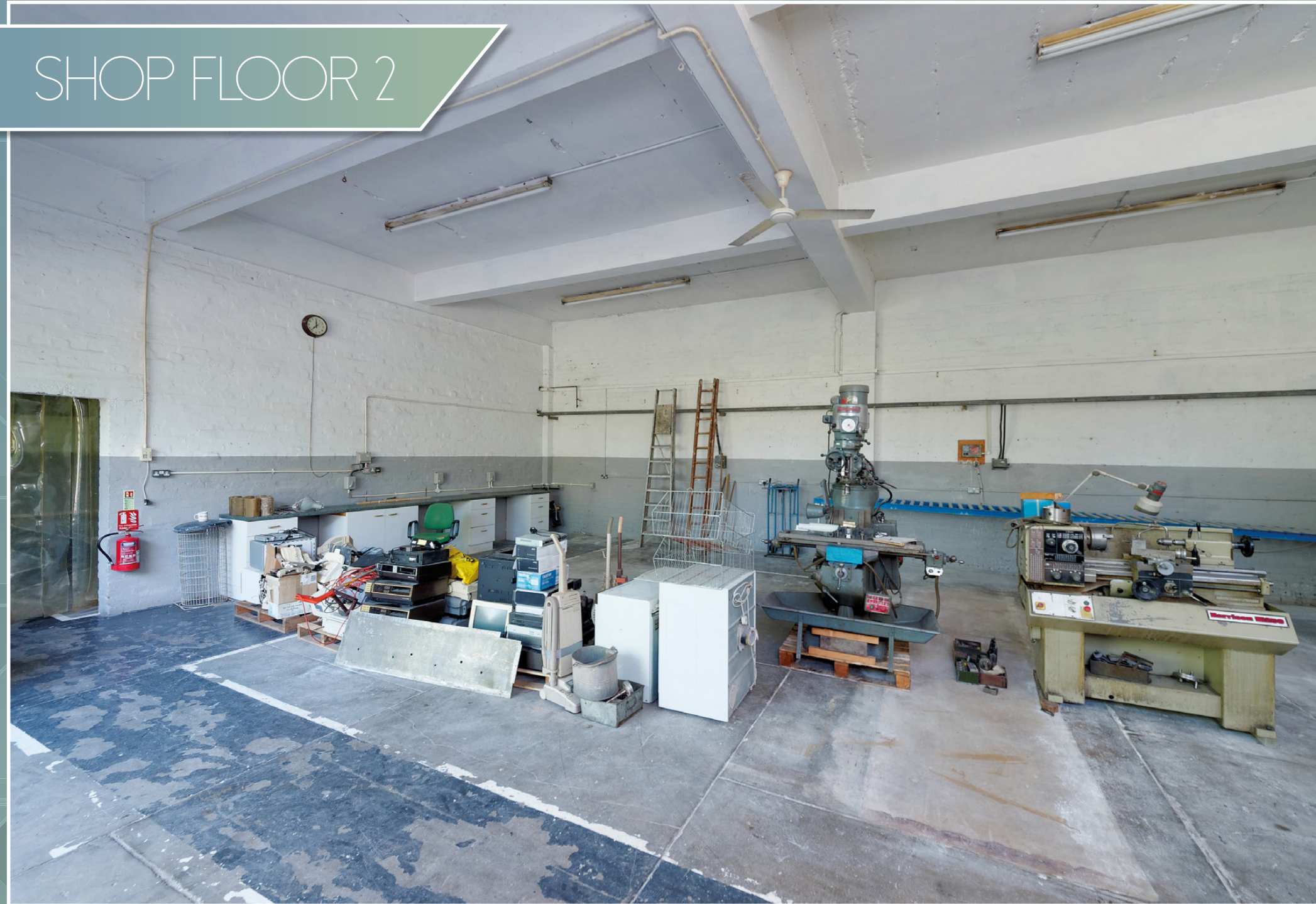
SHOP FLOOR 2