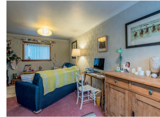
KITCHEN / LOUNGE / CONSERVATORY / DINING ROOM / CONSERVATORY / BEDROOMS / FAMILY BATHROOM / WC