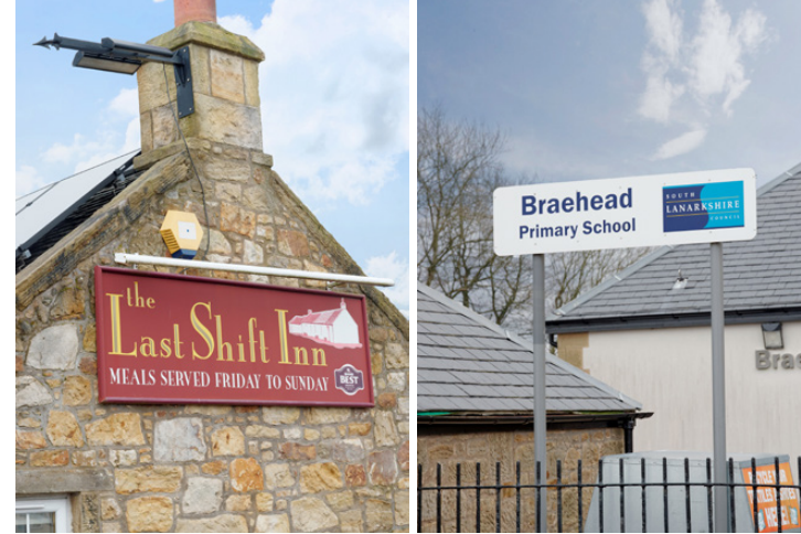
SCENES FROM BRAEHEAD VILLAGE, INCLUDING BRAEHEAD PRIMARY SCHOOL, PARK AND THE LAST SHIFT INN

There were three additional plots granted at a similar time and these have now been complete which create an established feel to the area. The site is approximately 960m2 with a width of 21-meter x 46-meter deep. Services to the plot are close to the road side.