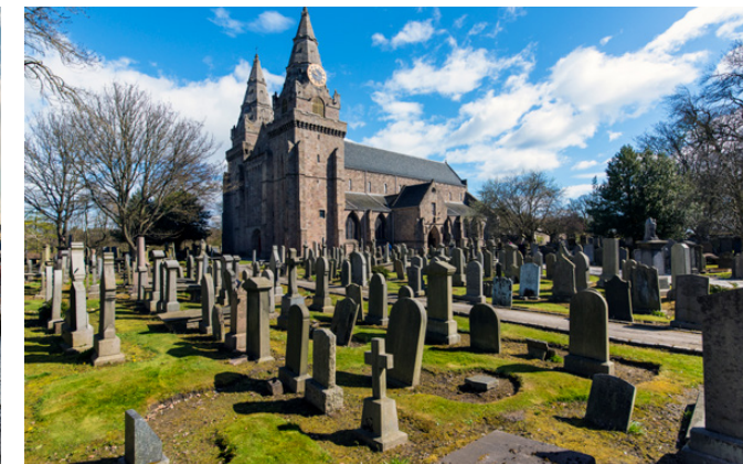
Marischal College Exterior, Aberdeen University Kings College, Rig Support Vessels Harbour and St Machar's Cathedral Church of Scotland