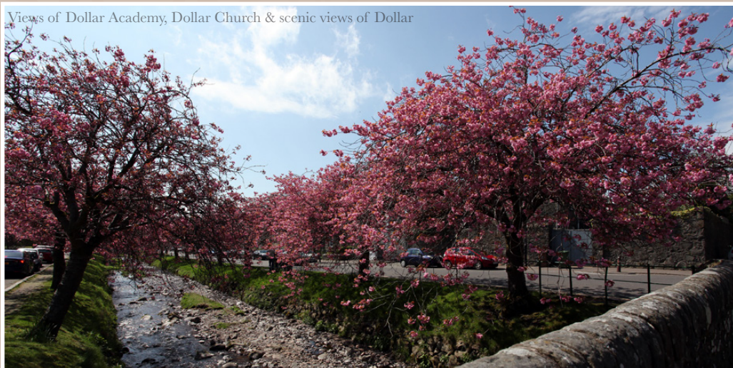
Views of Dollar Academy, Dollar Church & scenic views of Dollar