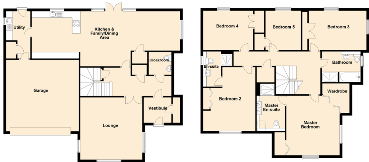
Approximate Dimensions (Taken from the widest point)