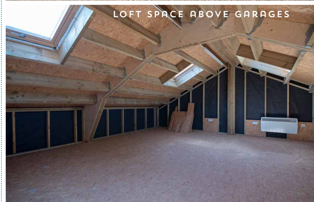
LOFT SPACE ABOVE GARAGES