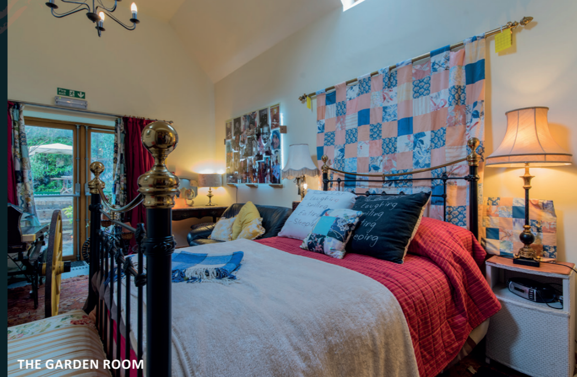
THE GARDEN ROOM

The whole of Fournet House is fitted with a fully integral fire alarm system and the control box is located in the inner hall opposite the main staircase. The house is divided into zones and it is a very effective system. The kitchen has been fitted with the latest rules and regulations and the disabled toilet was built when the property was upgraded to become a guesthouse. Full permissions have been obtained for all work completed in the property while the garden has planning permission in place to be a therapy garden and work has already started on this project.