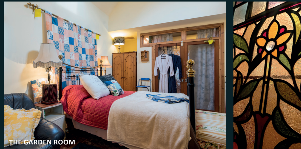
THE GARDEN ROOM