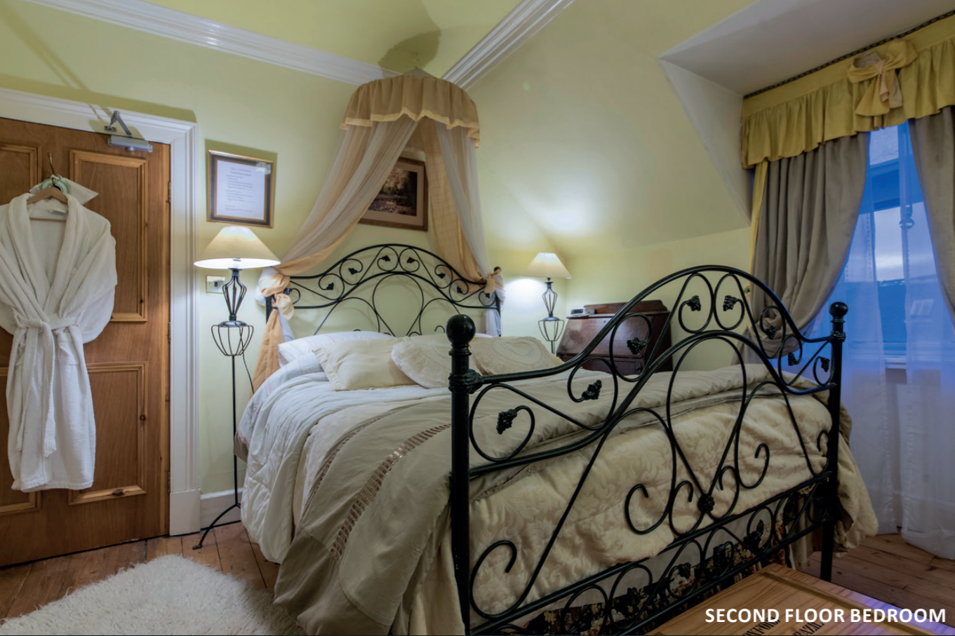
SECOND FLOOR BEDROOM