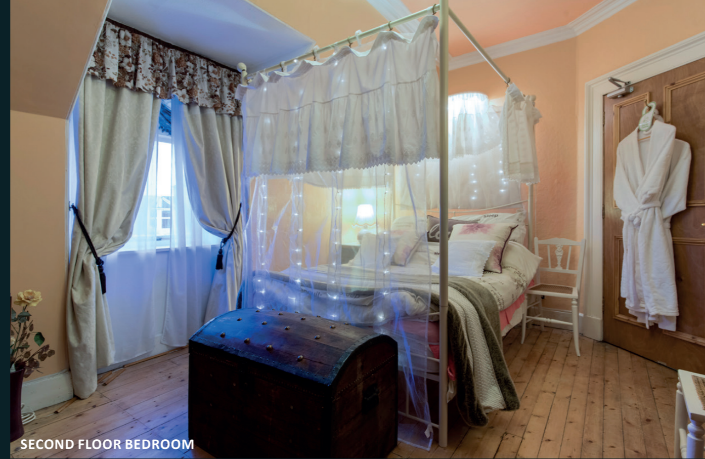
SECOND FLOOR BEDROOM