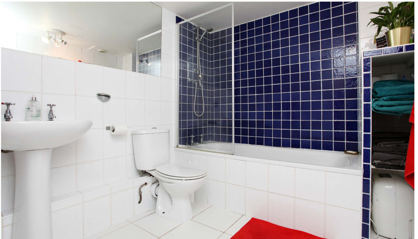
BEDROOM & BATHROOM