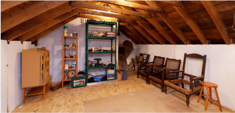
Bedroom 3 & Attic