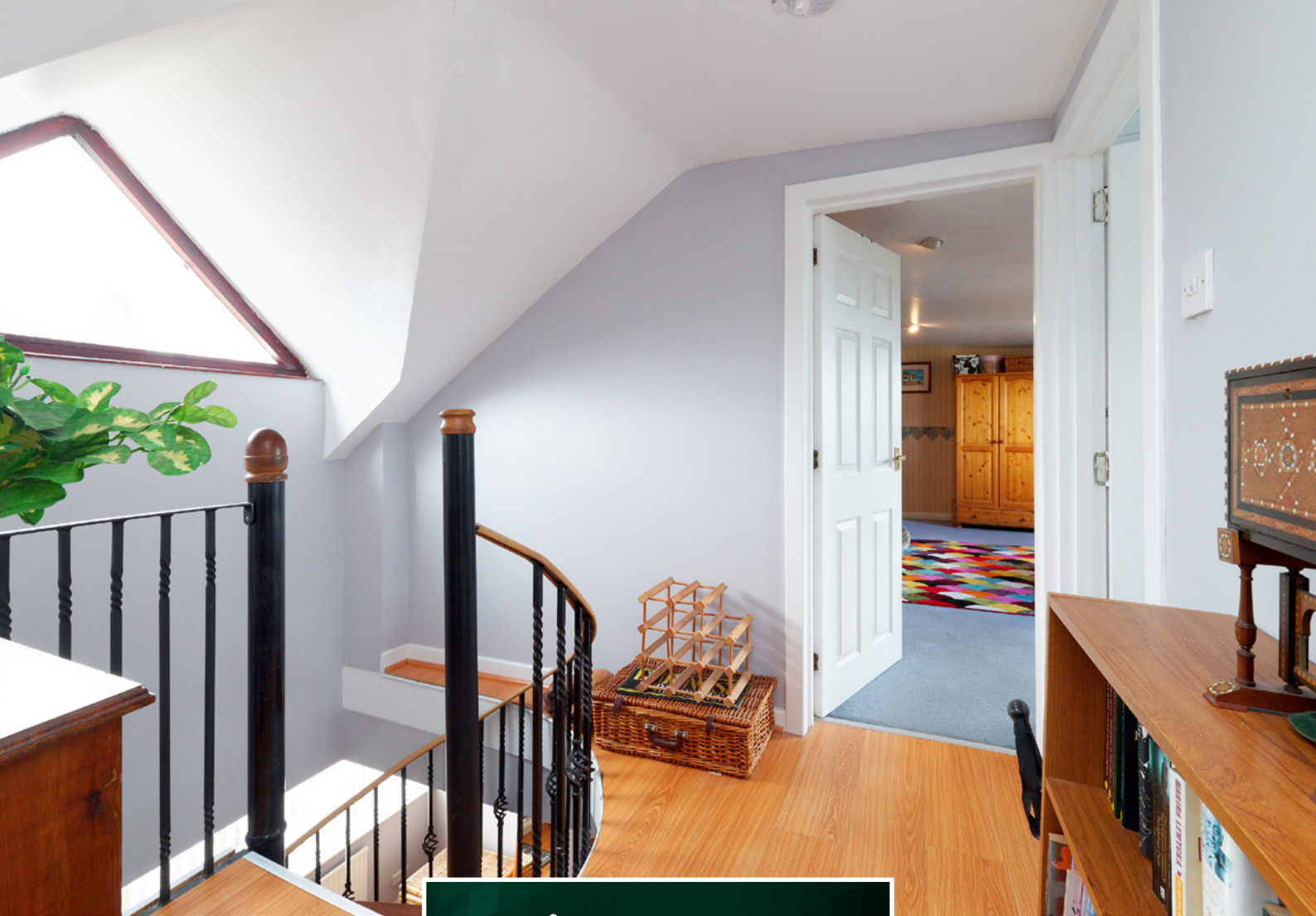
Landing & Bathroom