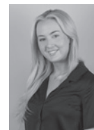
Professional photography ERIN MCMULLAN Photographer