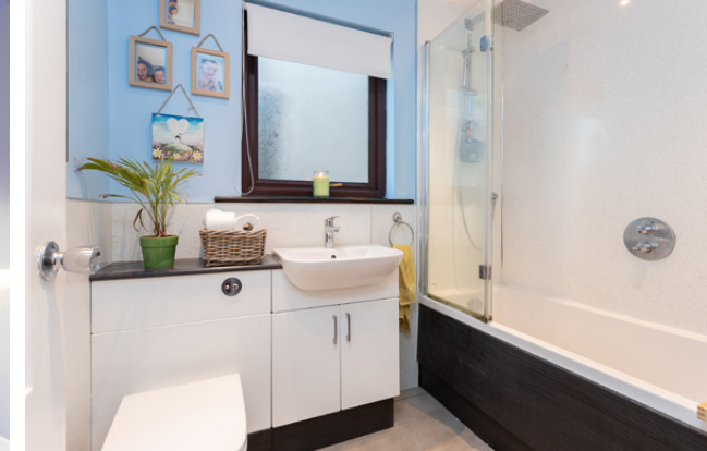
BEDROOMS & BATHROOM