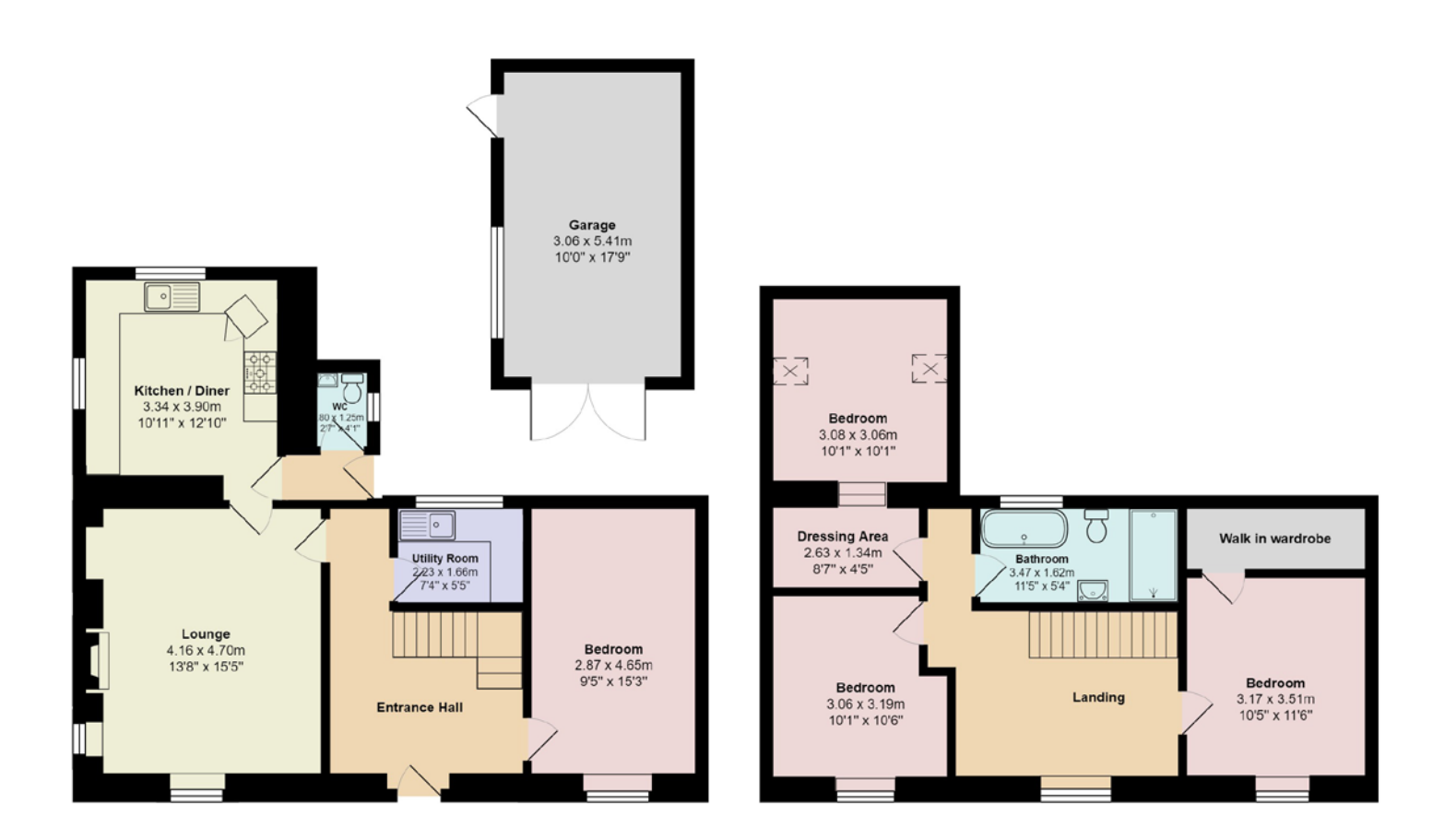
Approximate Dimensions (Taken from the widest point) Gross internal floor area (m<sup>2</sup>): 136m<sup>2</sup> | EPC Rating: C