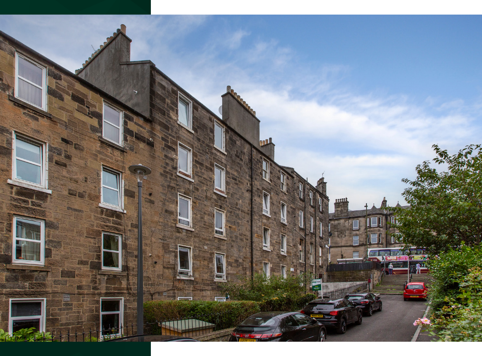
CENTRALLY LOCATED ONE-BED FLAT