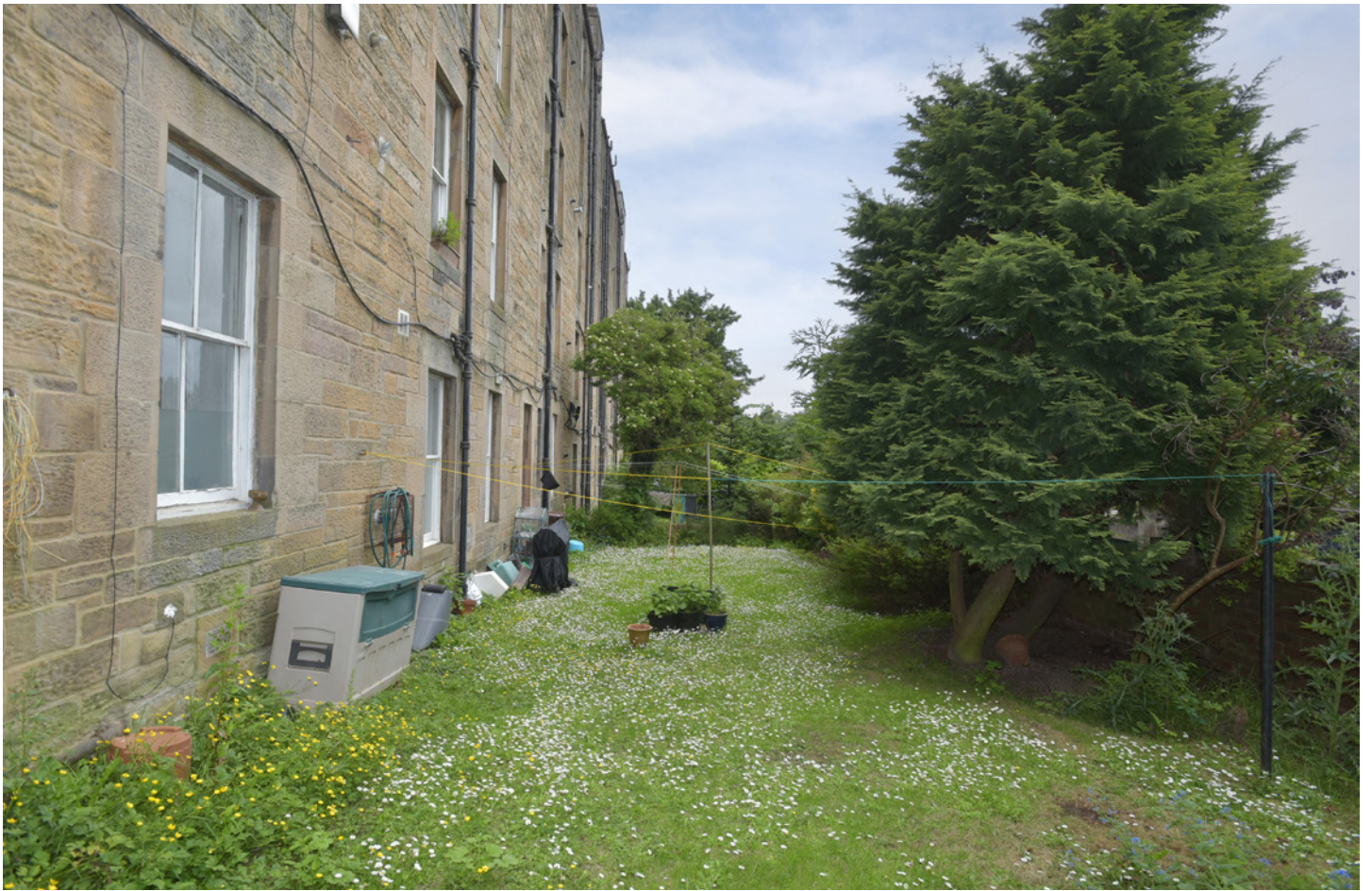
Externally, the property has access to a well-maintained communal garden.