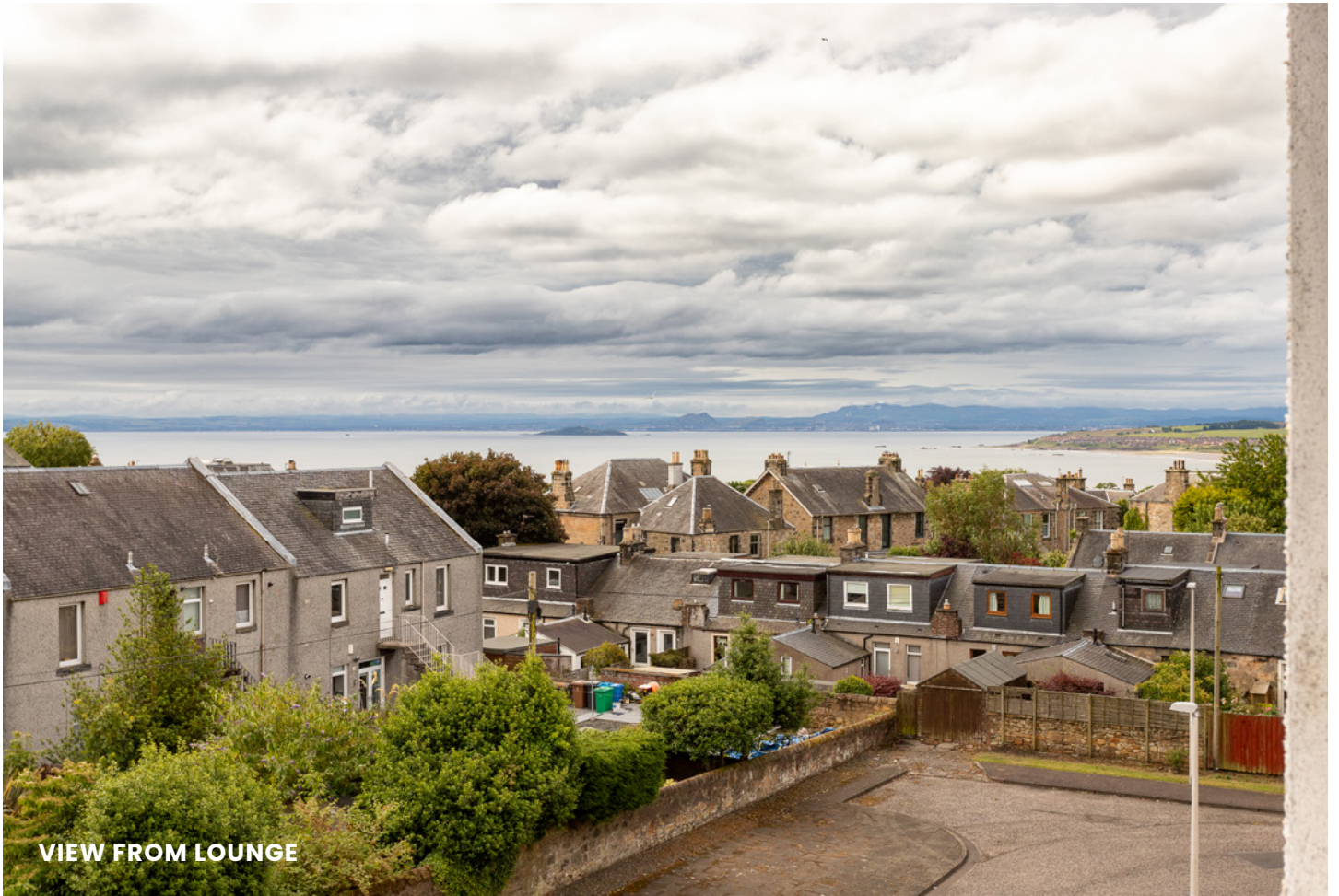
VIEW FROM LOUNGE