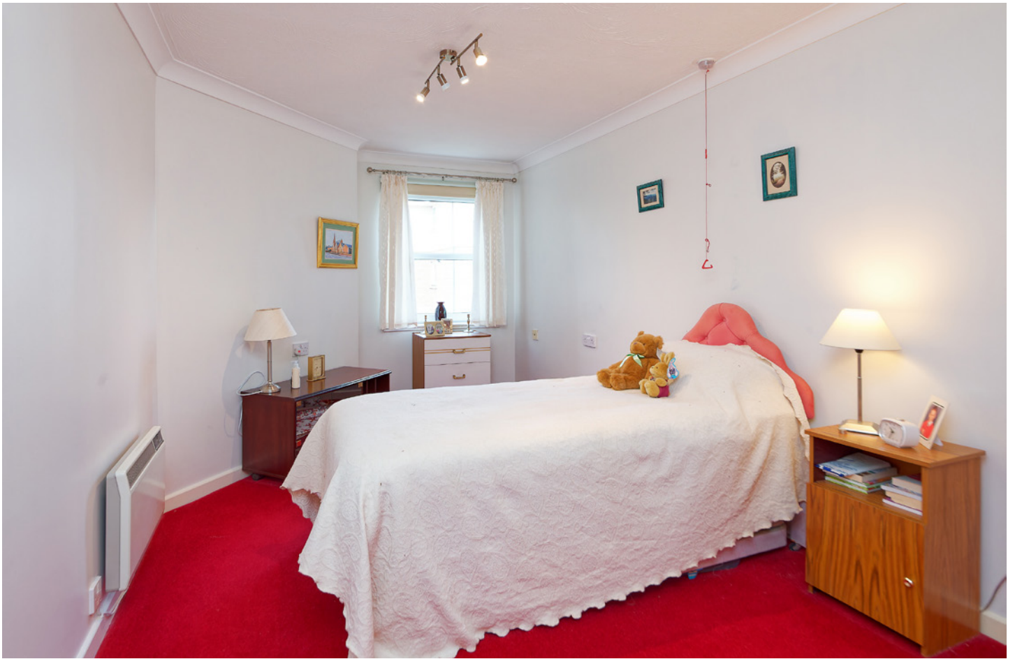
The two double bedrooms are a great size, with ample space for free-standing furniture, lots of natural light and built-in storage.