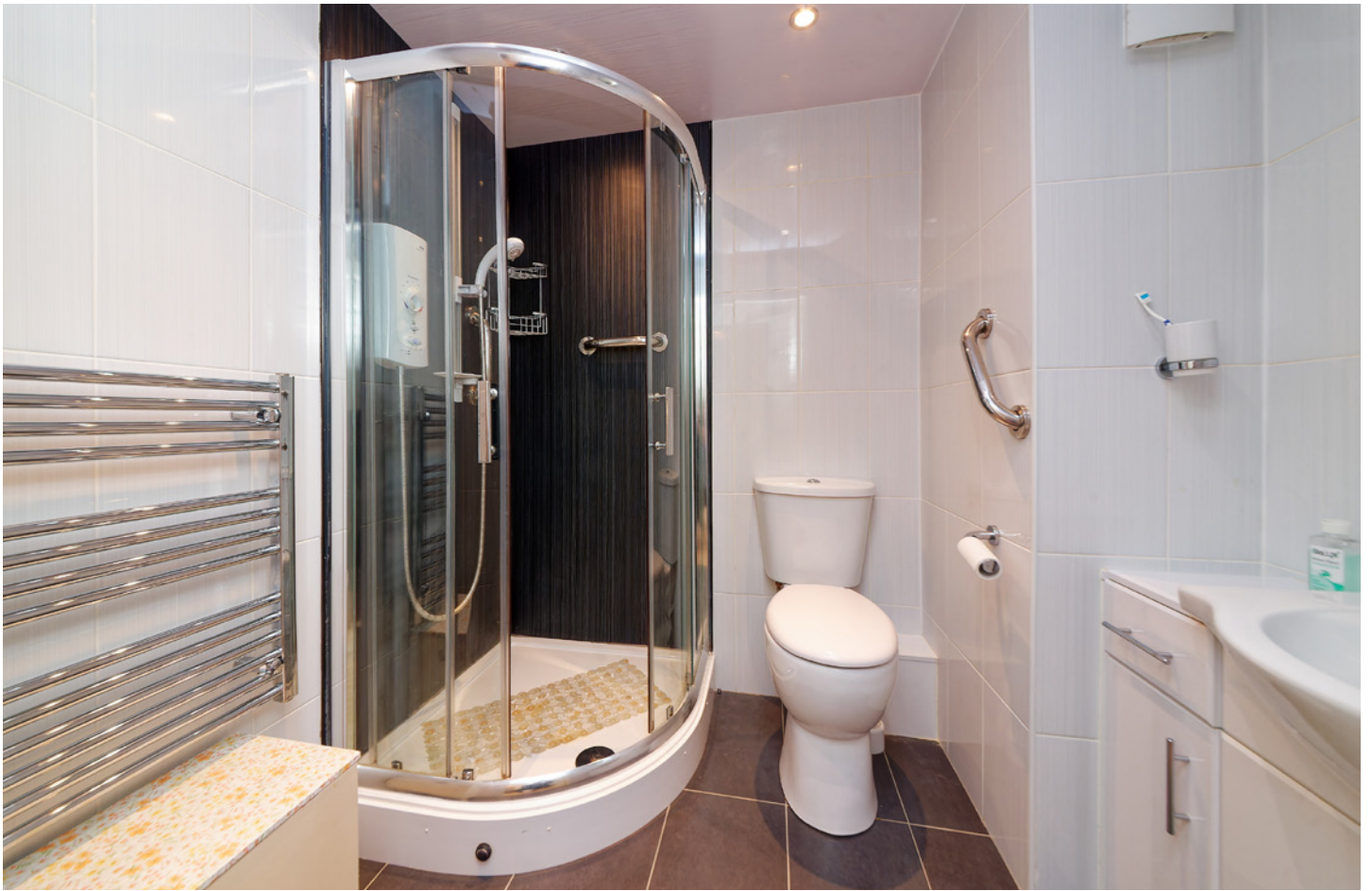
The shower room is bright and fresh, finished in a white suite with an electric shower set within a quadrant shower unit along with a chrome towel radiator.