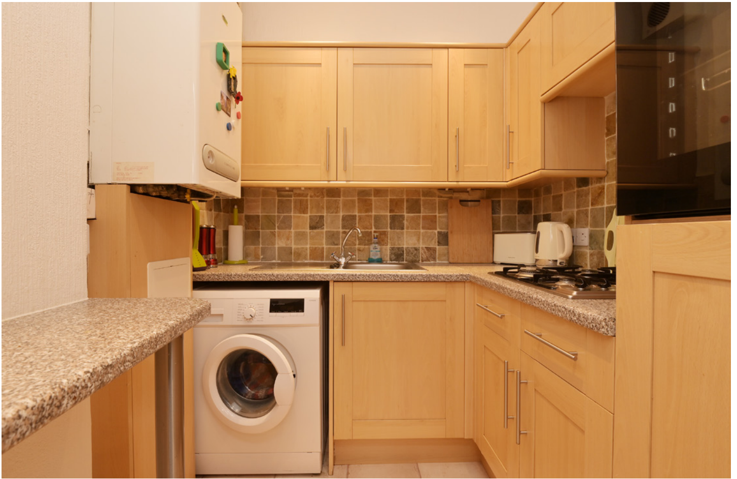
A fully equipped kitchen which is accessed from the living room and is fitted with gas hob, fan oven and fridge freezer.