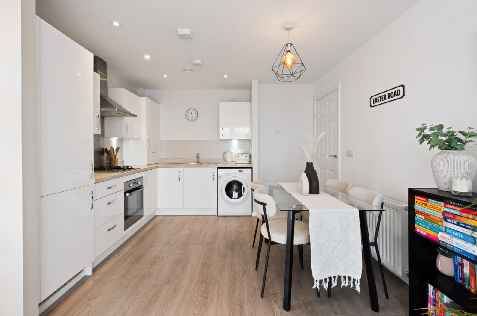
The kitchen is well-appointed with sleek cabinetry, an integrated gas hob and oven, and stylish spotlight lighting, while the living area is flooded with natural light through French doors opening onto an elegant Juliet balcony.