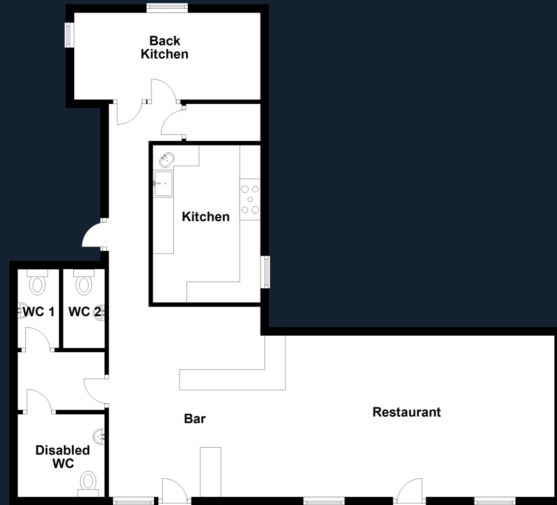
Approximate Dimensions (Taken from the widest point)