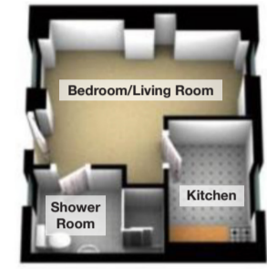
STAFF ACCOMMODATION ONE, LOCATED BELOW KITCHEN STORE TO THE REAR OF THE LODGE