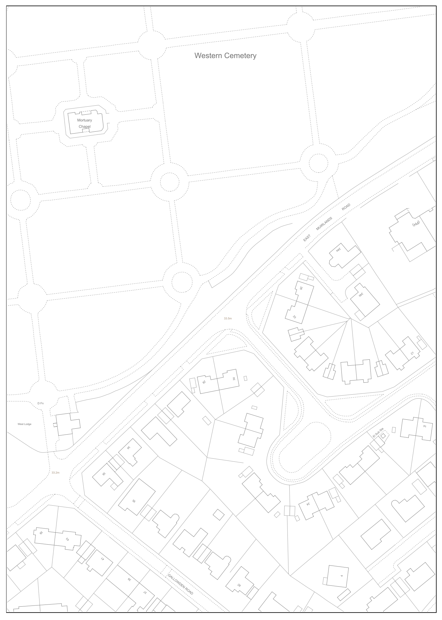
ANG86402 Page 3 of 6