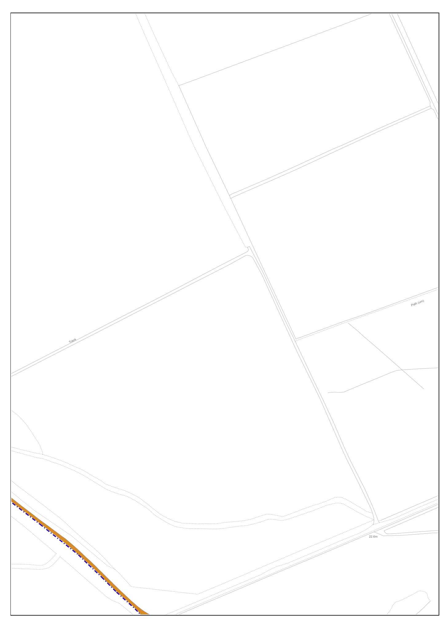
MOR10465 Page 2 of 4