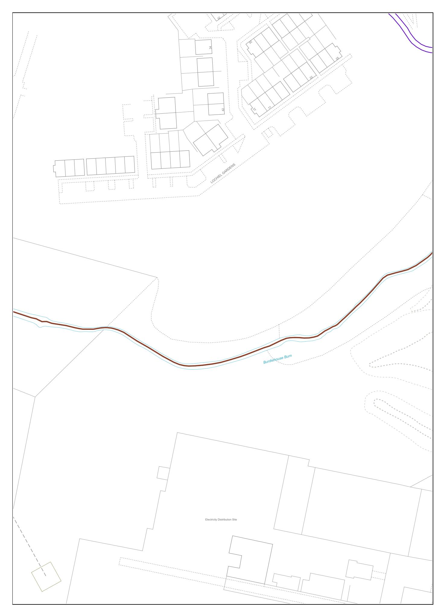
MID218967 Page 8 of 9