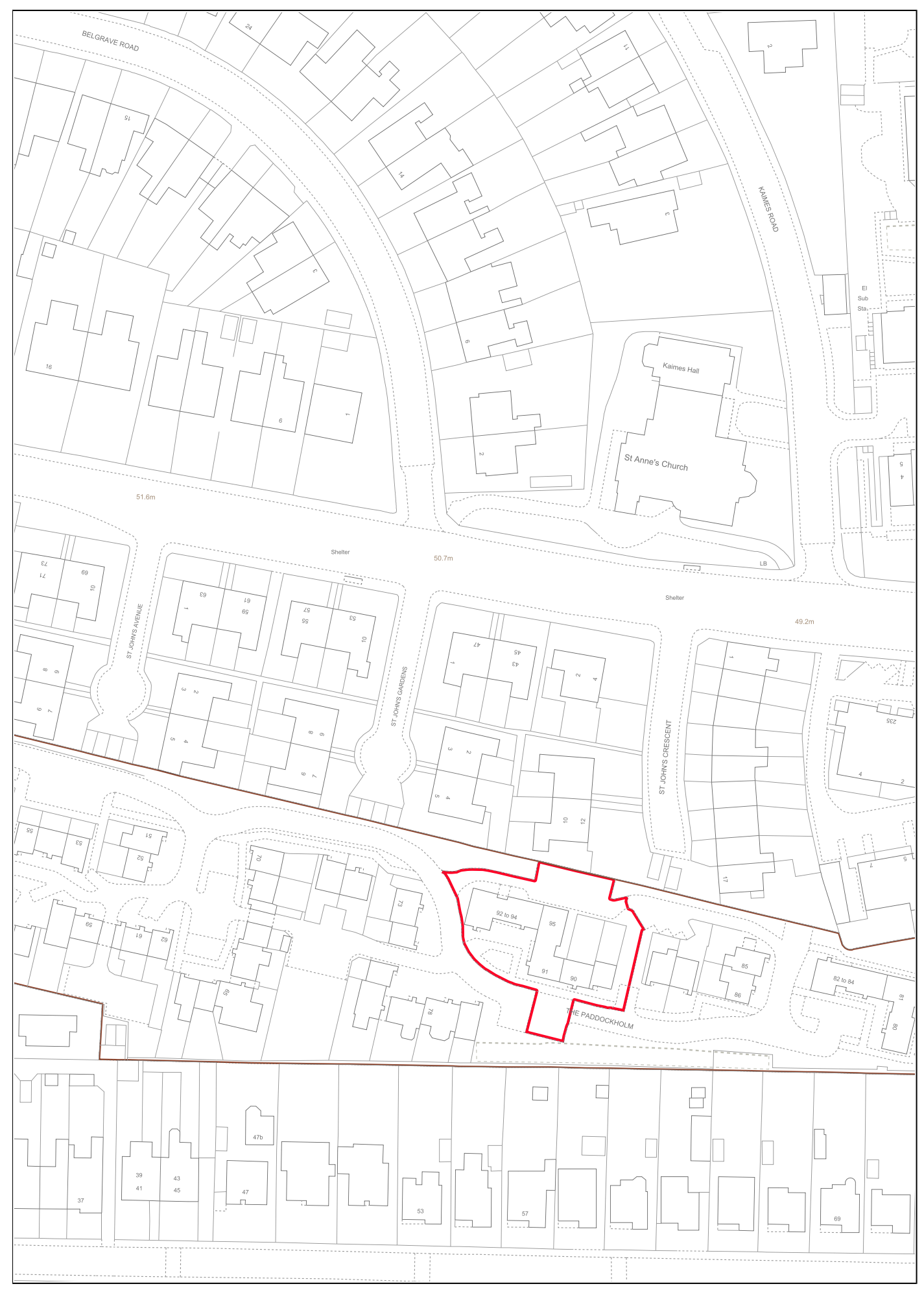
MID235265 Page 2 of 3