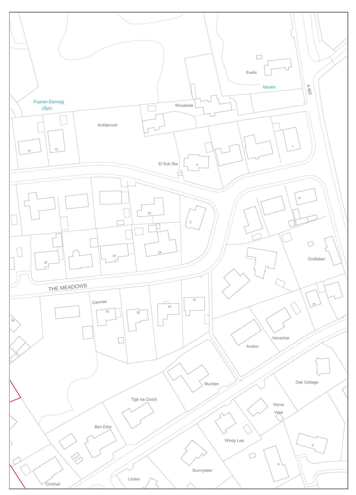
ROS6883 Page 3 of 6