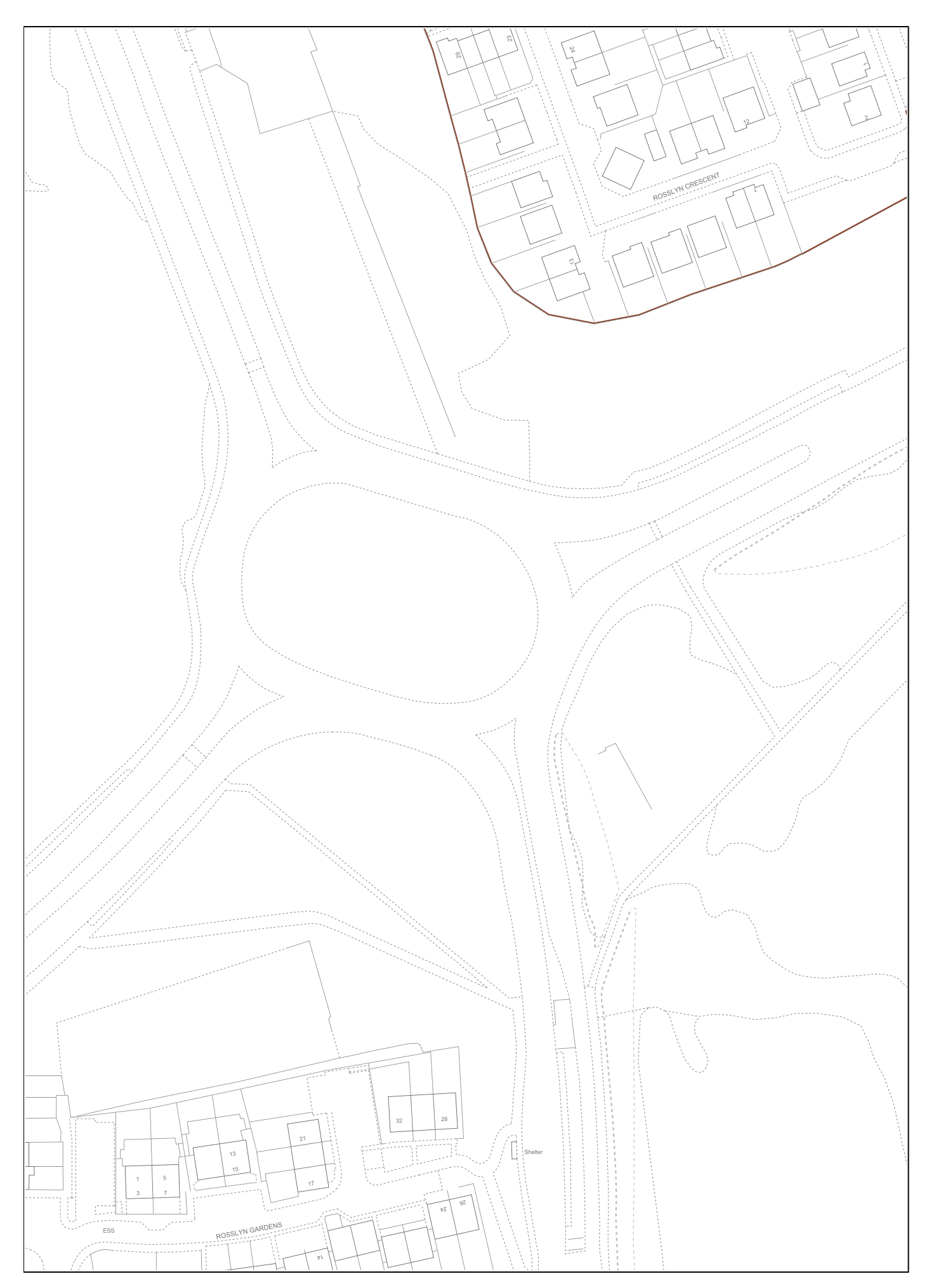
FFE136665 Page 3 of 4