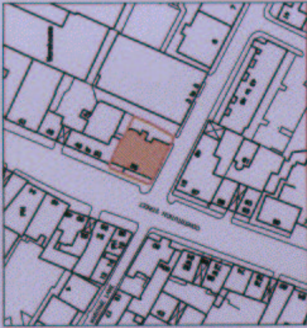
N LOCATION PLAN 1:1250