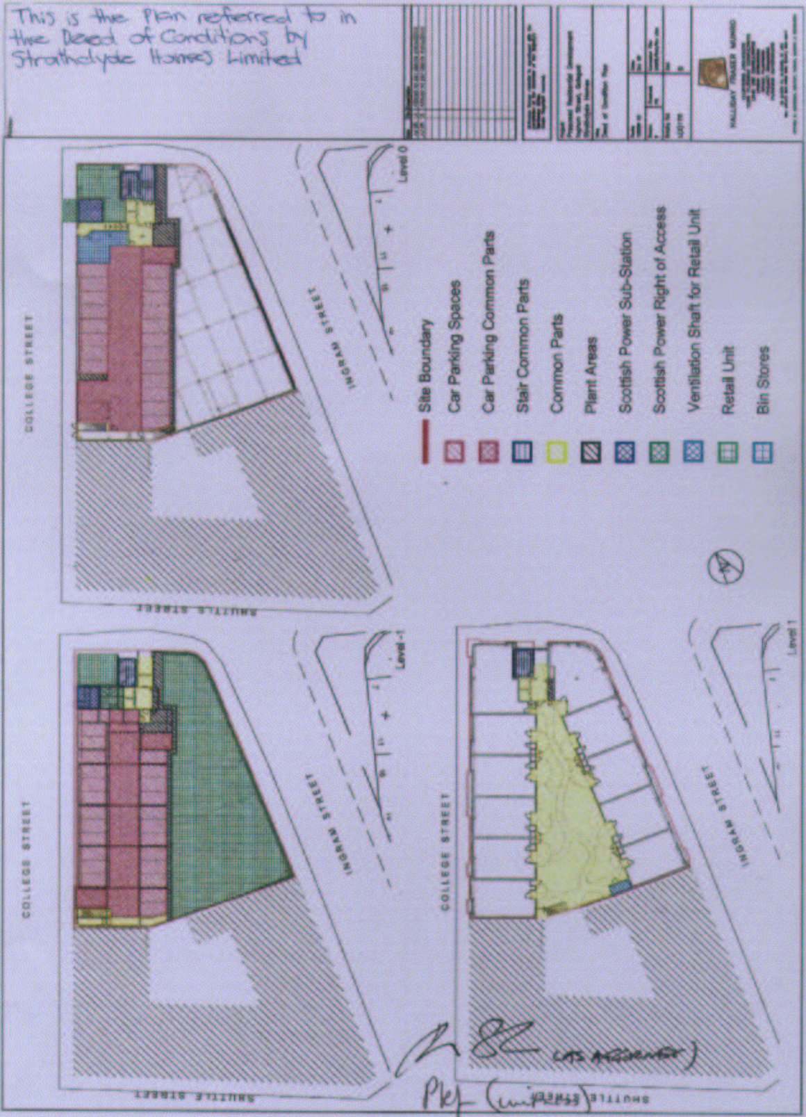
SUPPLEMENTARY PLAN 2 TO THE TITLE PLAN