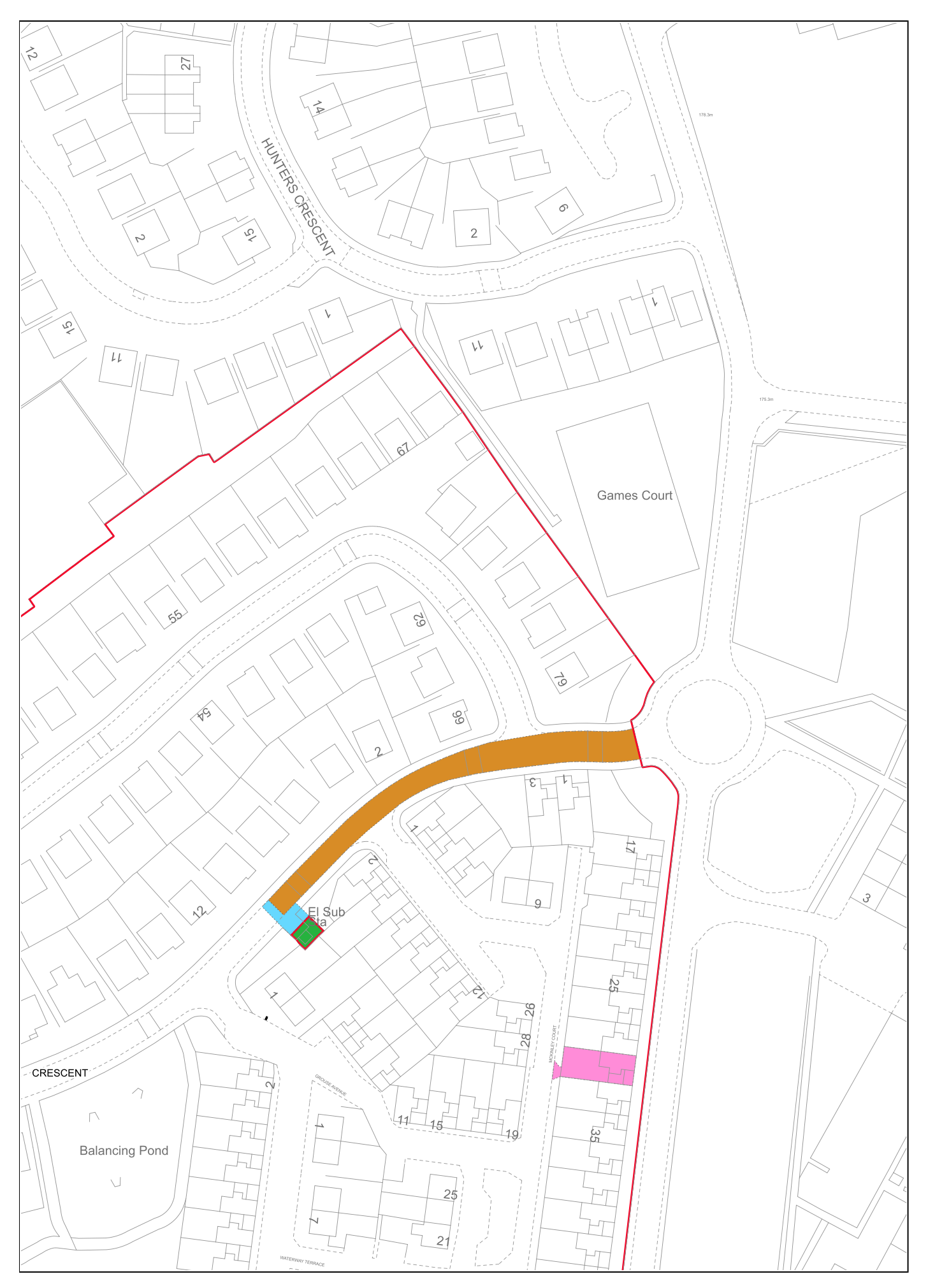
LAN214223 Page 2 of 4